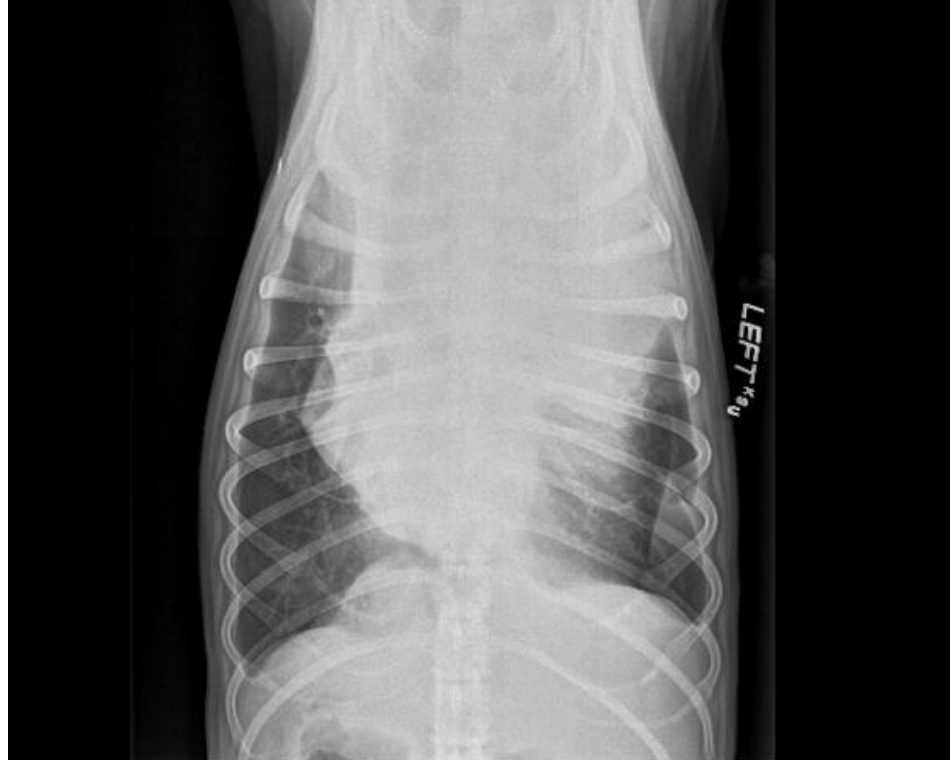
Thoracic Radiograph Findings: